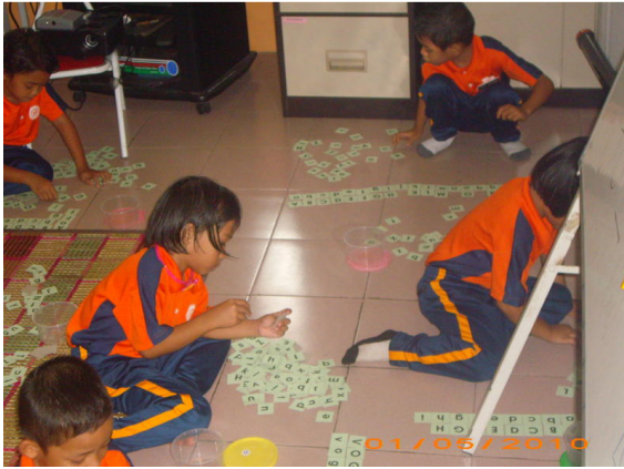
12. Some of the students using the alphabet tablet in a classroom activity during the visit by the project coordinator