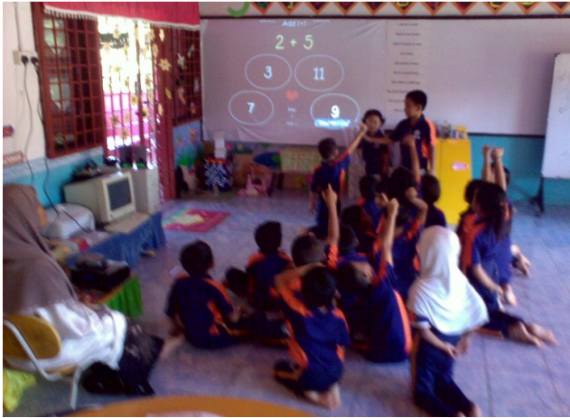
6. Students participating enthusiastically in a classroom