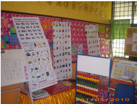
13. Some of the Quantum English materials used in the classroom in SK Mambang