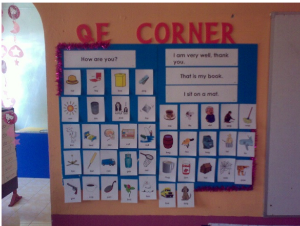
7. Quantum English Corner in which some of the total 75 materials are being displayed in SK Pekan Jaya